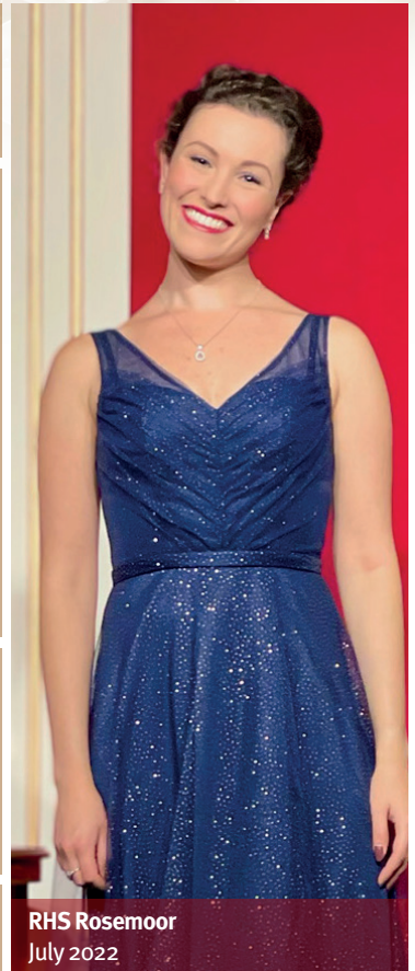
RHS Rosemoor July 2022

‘What did Devon Opera do during the Pandemic?’ and ‘what will be the new normal?’ are questions I’ve been asked countless times.