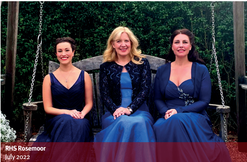
RHS Rosemoor July 2022