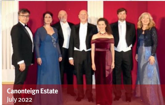
Canonteign Estate July 2022